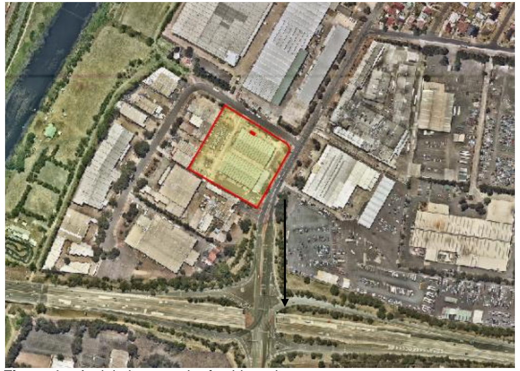
Figure 1 – Aerial photograph of subject site

This planning proposal is site specific and relates to land at 2A & 4 Helles Avenue, Moorebank (Lots 1 & 3 DP626253). The site is approximately 1.2km south-east of the Liverpool City Centre and accessed via Moorebank Avenue. The site and its surrounds are zoned IN1 – General Industrial, with the nearest residential development approximately 250m north-east of the site. The approved Moorebank Intermodal Terminal is located approximately 1km south (on the southern side of the M5) and Helles Park is 160m to the west. Mannheim Auctions is located directly opposite the site at 144 Moorebank Avenue, Moorebank.